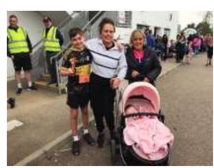
5th and 6th class school tour to Ballyhass

On Wednesday 12th June, 3rd, 4th, 5th and 6th class went on their school tour to Ballyhass