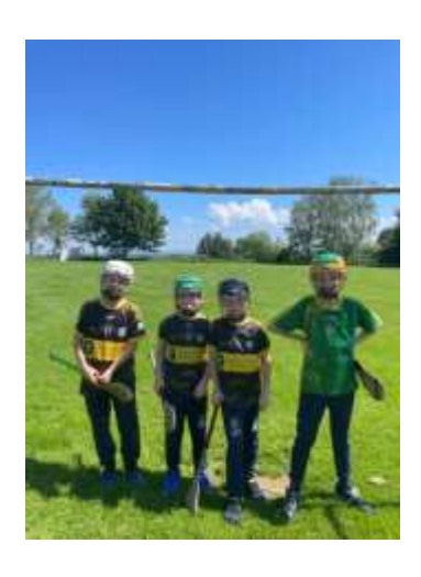
Read and Raise

This was the first year that we took part in the Read and Raise initiative. As we are already avid readers, this was an exciting and easy project for us. We were delighted to raise 965 euro in our classroom alone. We read a total of 8915 minutes and loved every minute of it. Every single child signed up and took part in this programme which was fantastic to see! A reminder to all parents about the amazing Summer Stars programme which runs out of local libraries over the summer months. This is a fantastic programme which really encourages children to continue reading for fun over the summer holidays.